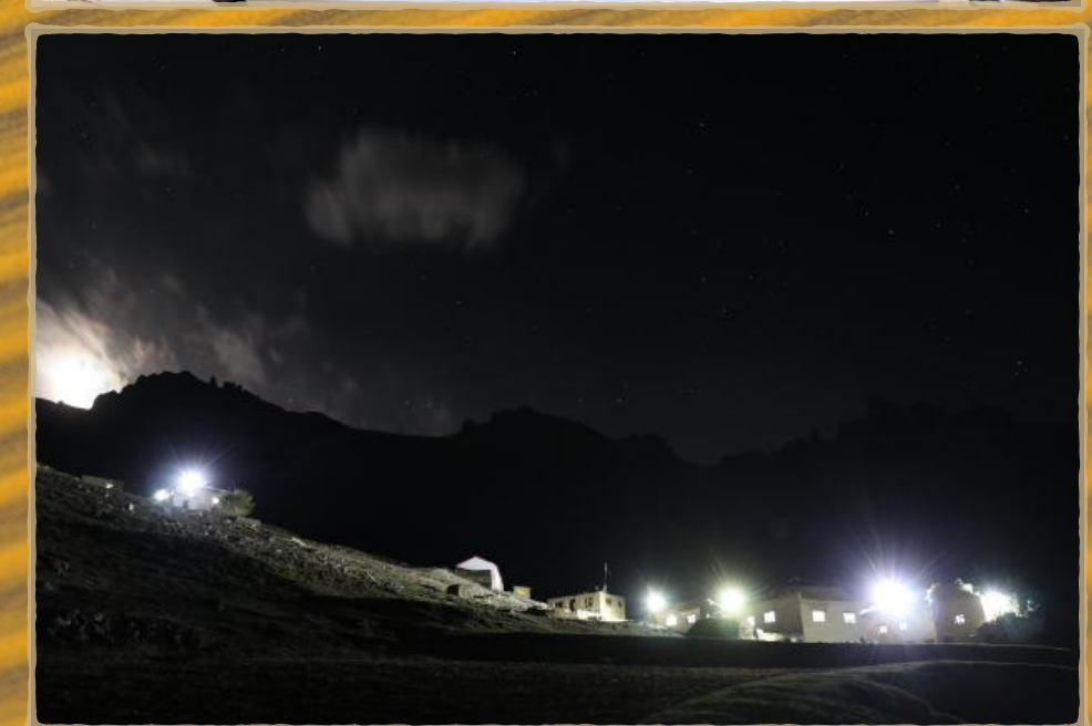
Lighting 1100 year old Ralakung village, the most remote in the Zanskar region of Ladakh